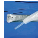
Hydrophilic (No Lube) Catheters