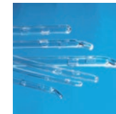
Smooth Eyelet Catheters