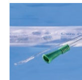
Catheters for Limited Dexterity