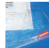
Sterile Closed-System Catheters